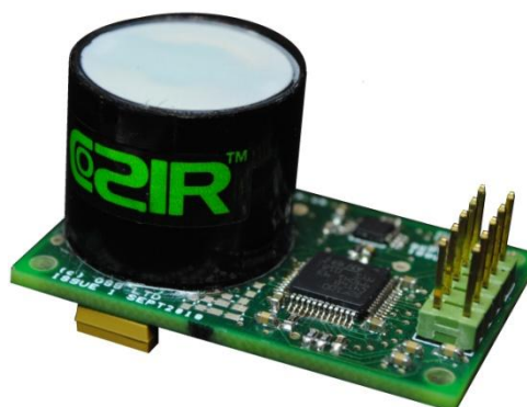
COZIR™ Wide Range Sensor